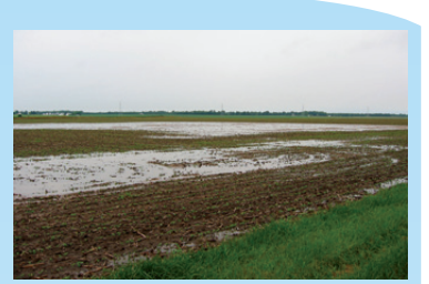
Surface runoff, Tippecanoe County, IN