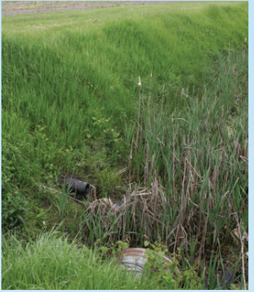
Surface drainage ditch, Tippecanoe County, IN