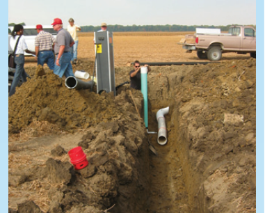
Drainage monitoring installation, DPAC Site, IN