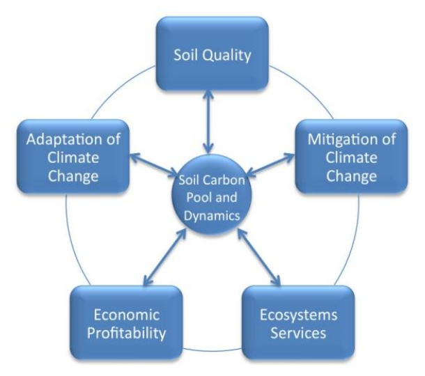
Figure 3. Data analysis and synthesis in relation to evaluating the carbon footprint, conducting life cycle analyses and assessing the use efficiency of input for a suite of agronomic practices.

<u>Soil Organic Carbon.</u> The dynamics of the SOC pool is the key determinant of soil quality