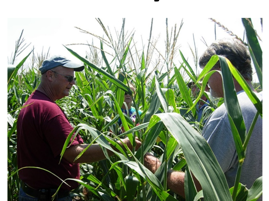
Learning from Farmers