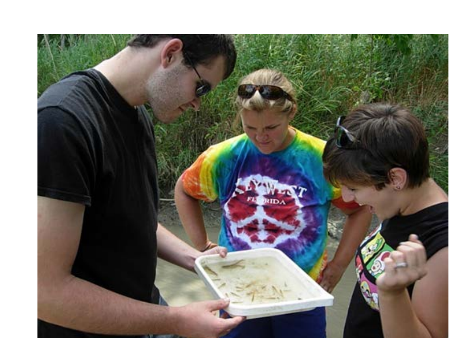
Invertebrate identification for HHEI measurements.