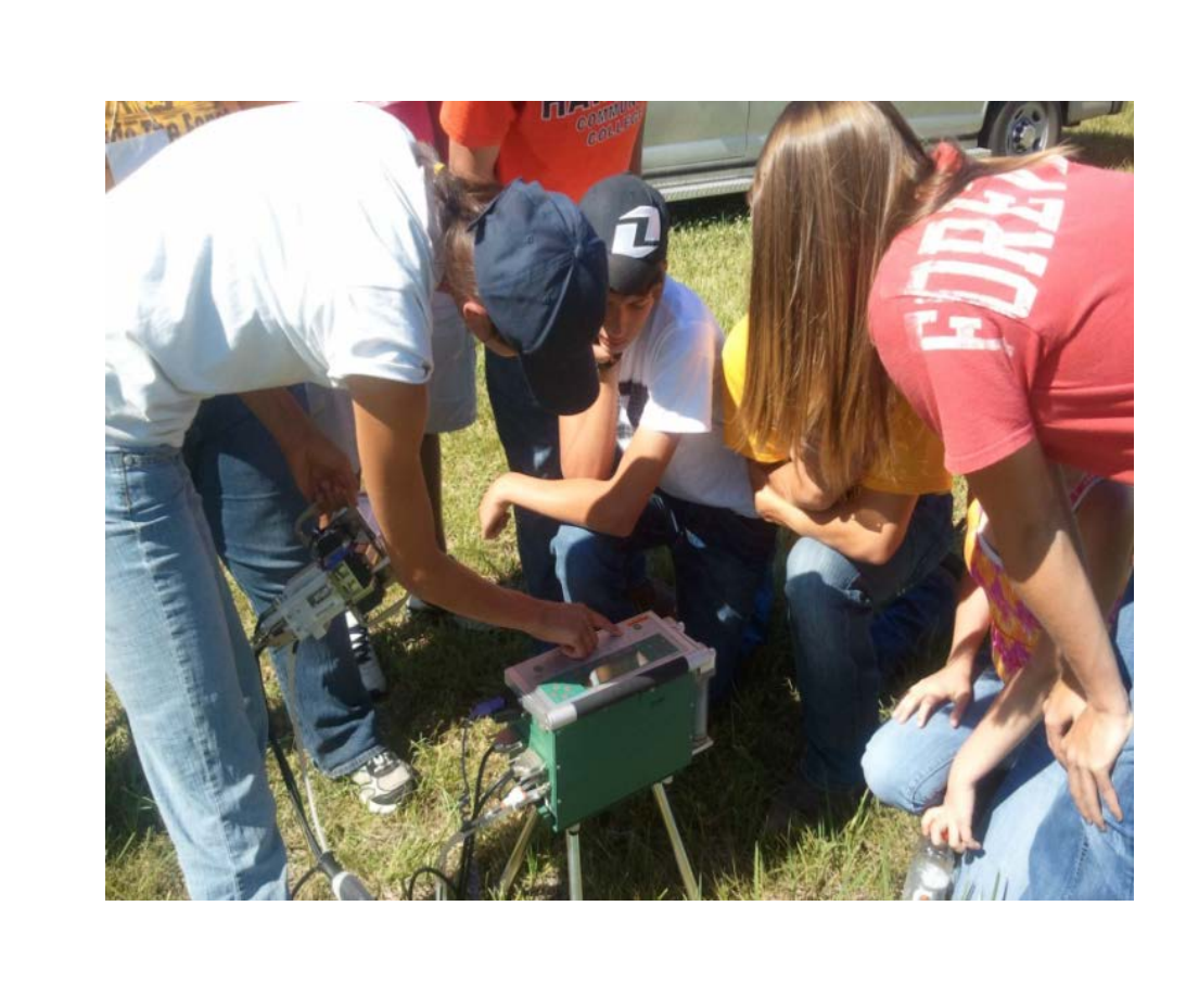
Learning how field measurements are taken and recorded