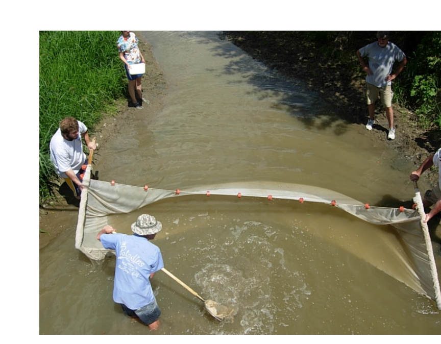
In stream sampling for HHEI measurements.