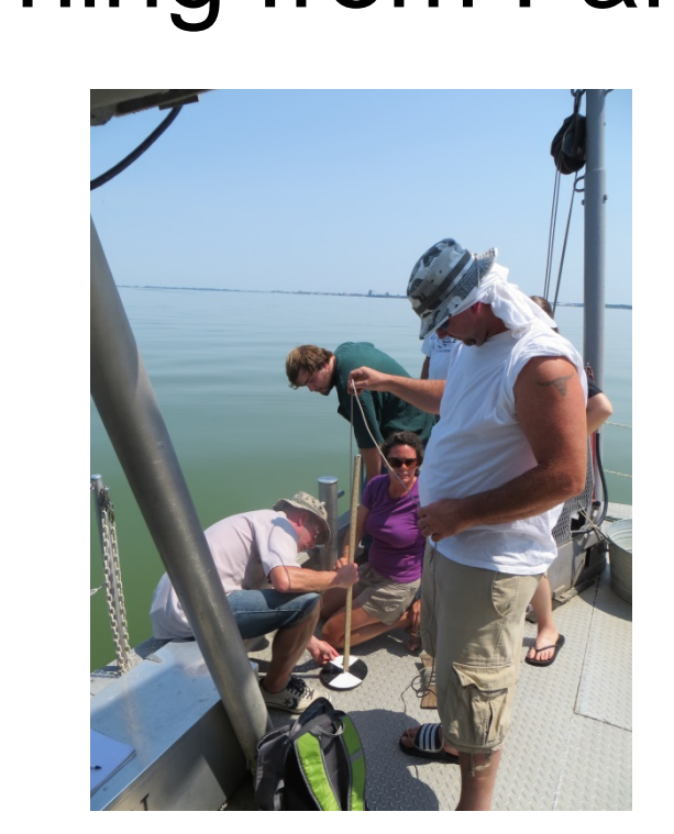
Measuring the Lake Erie alga bloom using a secchi disc.